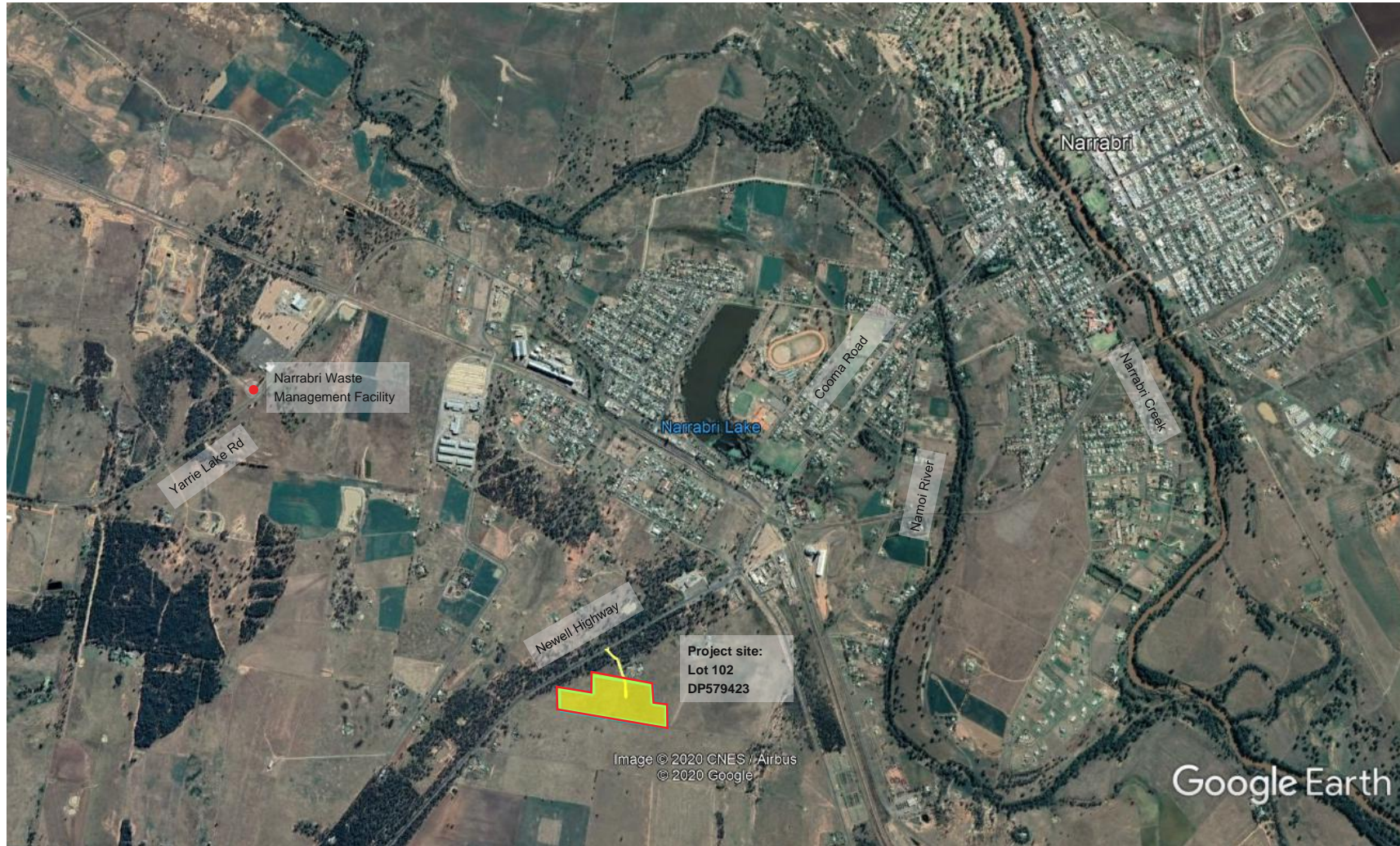
Figure 1 - Proposed 62 ha solar farm site and surrounding farm area (note the project will comprise 11.32 ha within this area)